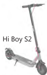
Hi Boy S2