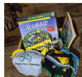
J D Theme Basket