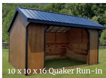
10 x 10 x 16 Quaker Run-in