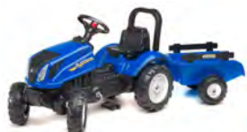
NH T6 Pedal Tractor, Trailer