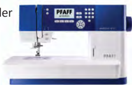
Pfaff Sewing Machine