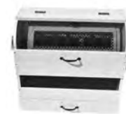
Pea Sheller Battery Powered

ABOUT THE CLINIC FOR SPECIAL CHILDREN: The Clinic for Special Children was established in 1989 as a non-profit medical service for children with complex medical needs. The Clinic's mission is to serve children and adults who suffer from genetic and other complex medical disorders by providing comprehensive medical, laboratory, and consultative services, and by increasing and disseminating knowledge of science and medicine. Today, CSC cares for over 1,100 active patients from 42 states and 17 countries and treats over 400 unique disorders.