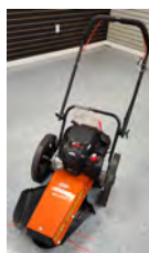
Echo Edge trimmer