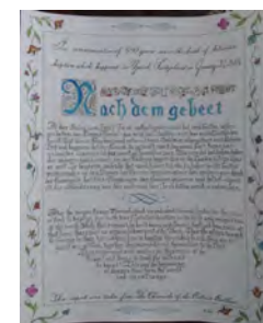
500th Anabaptist Anniversary Fraktur