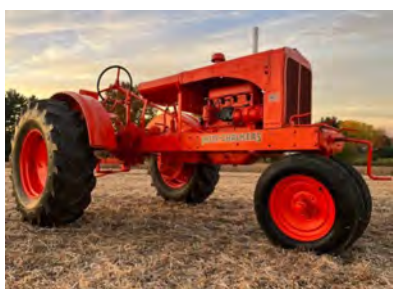
AC WC 934 Restored Tractor

6:30 AM Breakfast | 8:30 AM Auction Begins | 9:45 Theme Baskets | 11:00 AM Remarks by CSC Doctors & Staff | 12:00 Quilts | 12:00 Carriages | Lawn Furniture | Household Furniture | 1:00 Toys | Silent Auction Ends 1:00