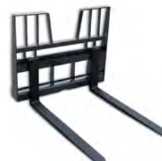
Pallet Fork 5500 lbs