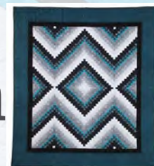
Moonlit Mountain Quilt

To Support the Clinic for Special Children®