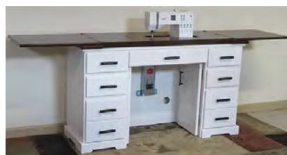
Sewing Machine Cabinets