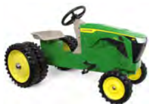
JD 8R Pedal Tractor