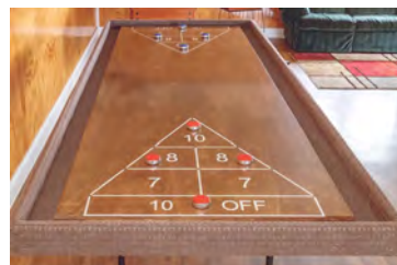
Table Shuffle Board