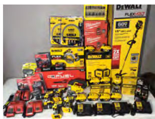
New Cordless Tools