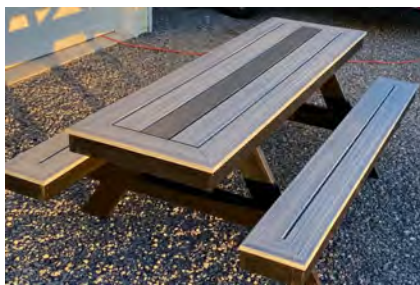
Poly Wood Picnic Table